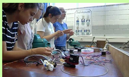
Fig 1: Girls assembling a 3D-printer

Our sample for the presentation consists of 116 students from 4 secondary school classes in the Eastern part of Switzerland ( M = 13 y). All of the classes participate in the project „STEM becomes a habit in schools“ (2016-2018). More participants as well as additional data from Austrian schools (project partner) are expected in the near future.