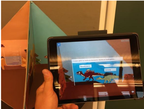
Fig. 3 Digital content superimposed onto the paper-based learning material

For the strategy of self-explanation, we created a worksheet with central questions and tasks about the dinosaurs. After each interaction with an AR element, the students worked on the worksheet and wrote down answers to the questions in their own words. One task, for example, was to arrange the dinosaurs according to their size (“create a ranking list”).