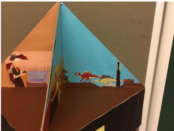
Fig. 2 Example of a paper-based 3D learning material

example, to display a video over a trigger image, the video is uploaded to AR Studio, linked to the corresponding trigger image and saved at the end. To display the AR content, you only need the Xpanda application. The designed contents were part of a science lesson, and the living habits of dinosaurs were chosen as the topic. Each corner of the learning material represented a different dinosaur, and information about its eating behavior, natural enemies, weight and size, etc., became visible via the digital AR overlay (Fig. 3).