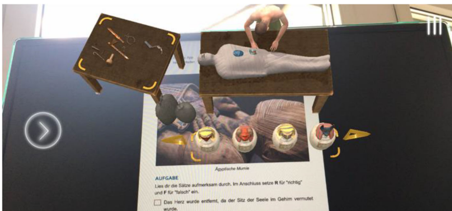
Fig. 4 Example of AR material used in the control condition (Buchner and Jeghiazaryan 2020)

For the learning strategy of self-testing, the participating teachers have designed a multiple-choice quiz with nine questions for their students. The quiz questions were formulated on the basis of the information from the AR elements. This allowed the students to evaluate whether they had understood the content of the learning environment. Open questions or problems of understanding were taken up and dealt with again in further teaching lessons. The students worked paper-pencil-based through the multiple-choice quiz at the end of the lesson (e.g., “The dinosaurs had similarities with...a.) crocodiles, b.) birds, c.) lizards”). Empirical studies proved that the use of quizzes to initiate retrieval practice is effective and therefore its usage is also recommended in the literature (Moreira et al. 2019).